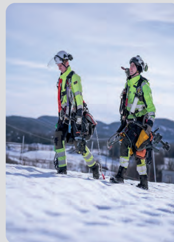
Electrical Safety is important in all sectors and we cover them all!